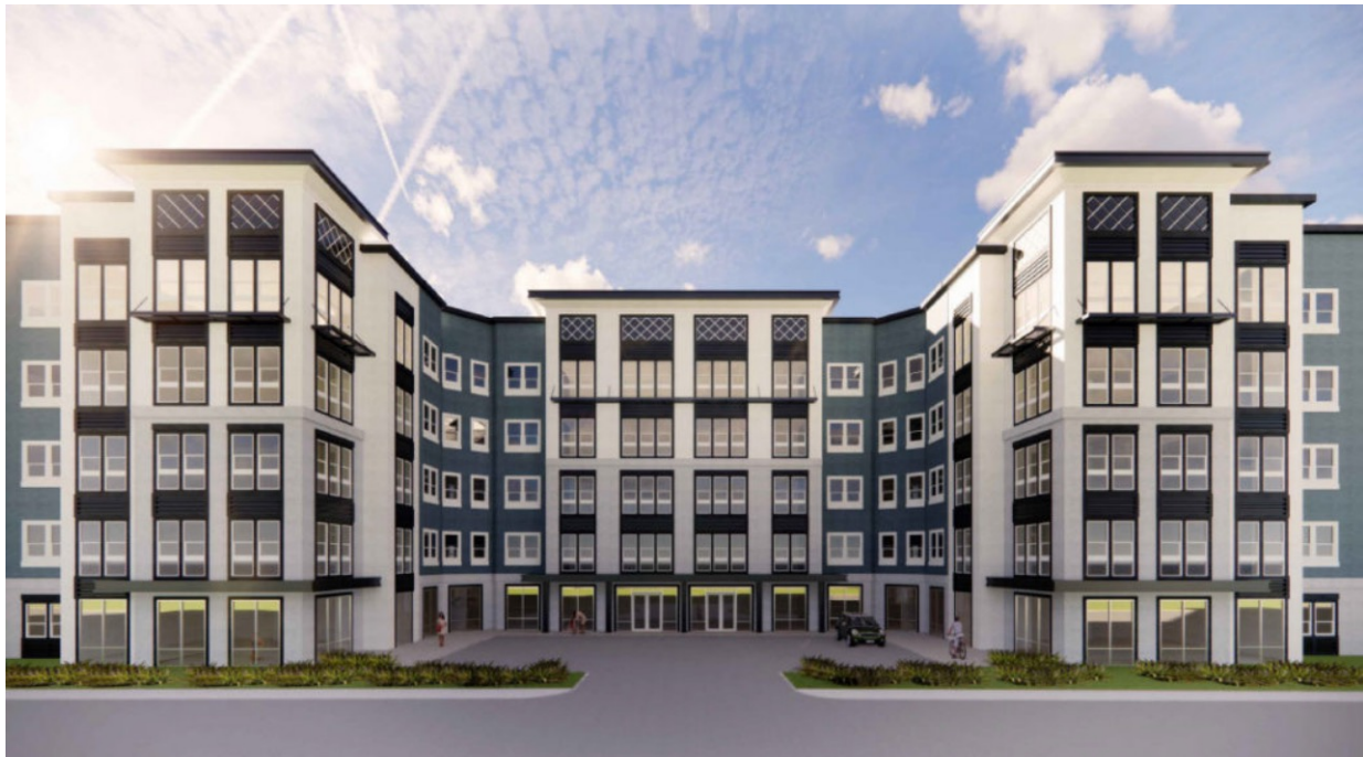
Haven at Washington - Phoenix AZ