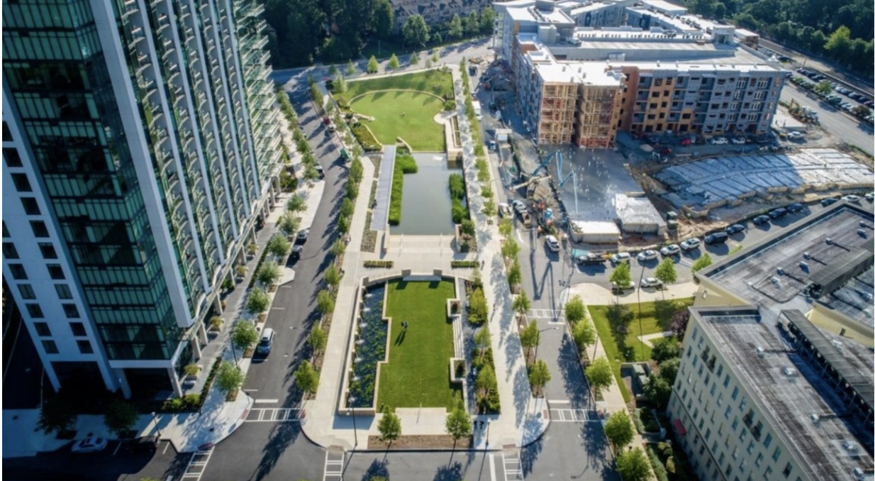
500 Sawtell - Atlanta, GA