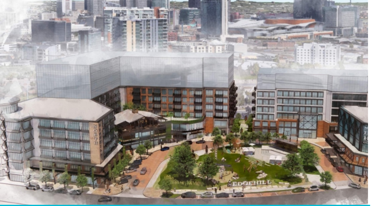
Edgehill Commons - Nashville, TN