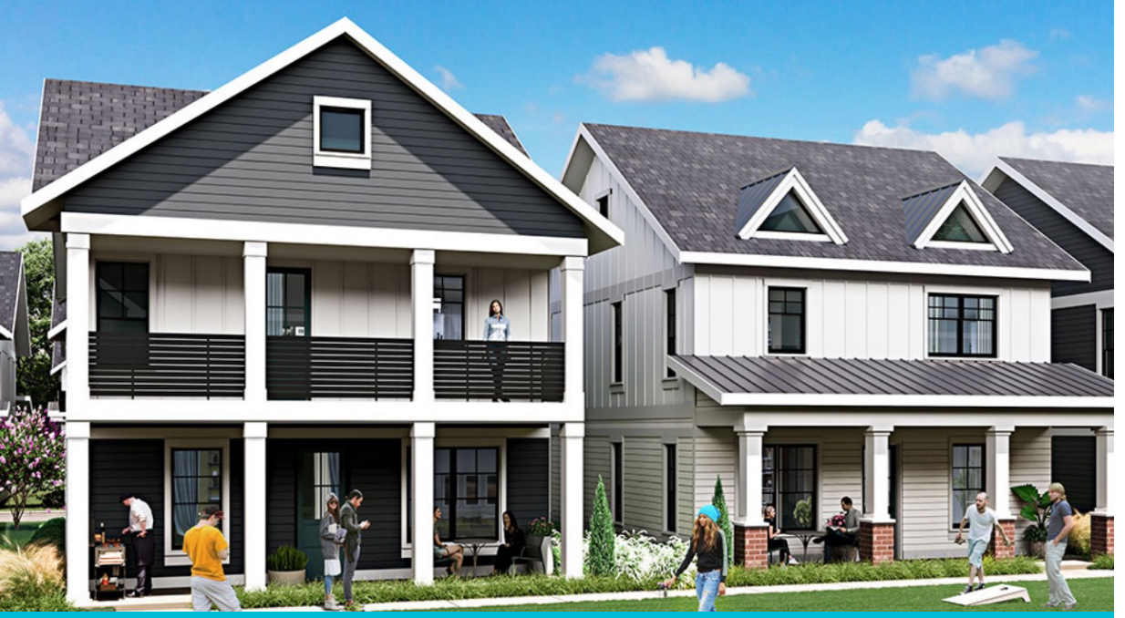
AVA Gainesville - Atlanta, GA