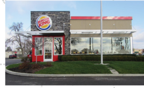
VINCENNES, IN BURGER KING