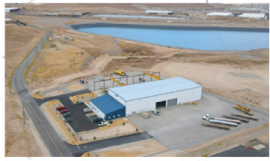
RENO-TAHOE, NV CMC OPERATED