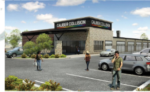
W. LAFAYETTE, IN CALIBER COLLISION