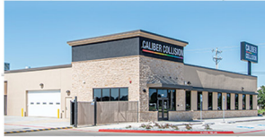
OKLAHOMA CITY, OK CALIBER COLLISION