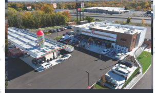
WEST HAVEN, CT 7-11 OPERATED