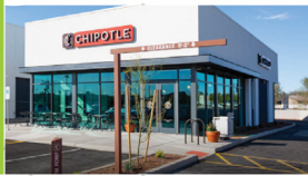
DELANO, CA CHIPOTLE OPERATED