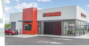
ROANOKE, VA CHIPOTLE OPERATED