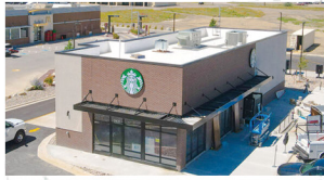
RAWLINS, WY STARBUCKS