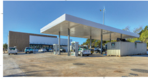
OKLAHOMA CITY, OK 7-11 OPERATED