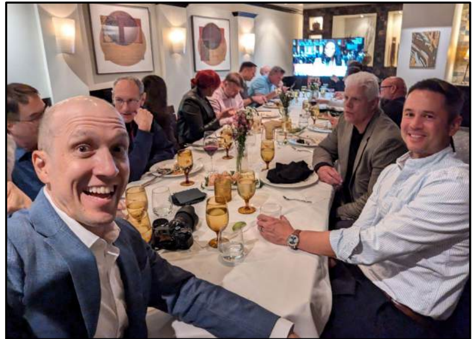
OZ Insiders dinner in Washington, DC. November 5, 2024.

Corporate Memberships available upon request. Email team@ozinsiders.com .